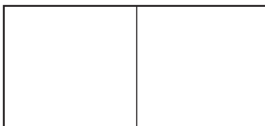
PLAN VIEW OF MOUNT LOCATION